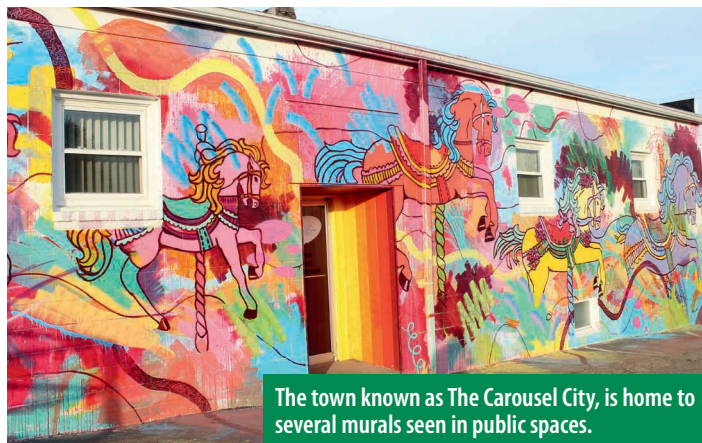
The town known as The Carousel City, is home to several murals seen in public spaces.

"That mural had such a positive impact on the community, I knew it would get the same kind of response here and create the