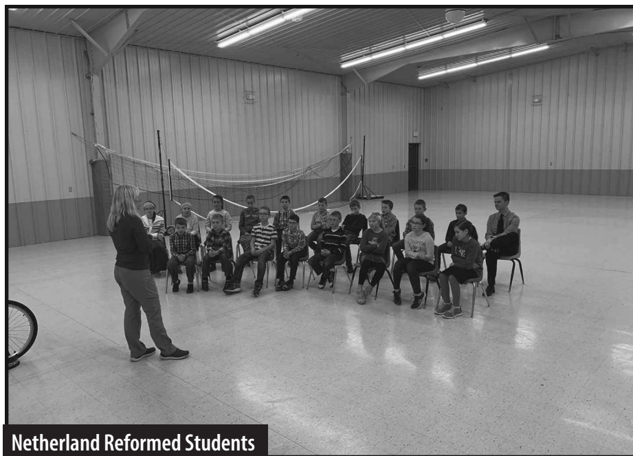
Netherland Reformed Students