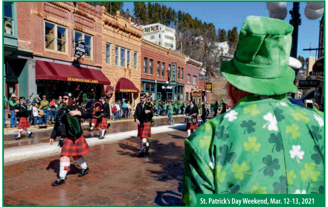
St. Patrick's Day Weekend, Mar. 12-13, 2021

St. Patrick's Day Weekend, Main Street, Deadwood, SD 605-578-1976