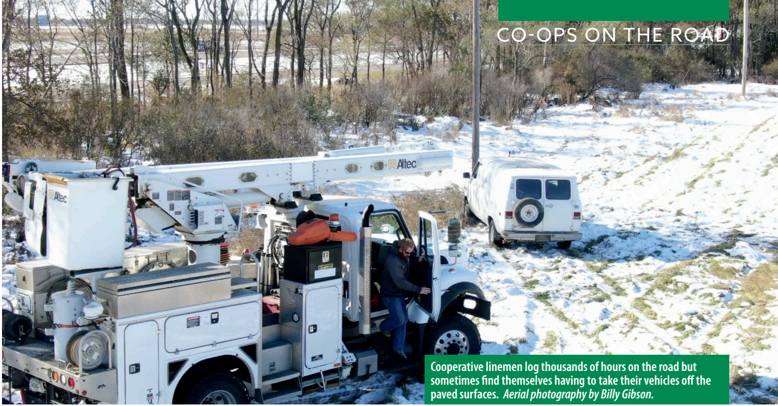
Cooperative linemen log thousands of hours on the road but sometimes find themselves having to take their vehicles off the paved surfaces.