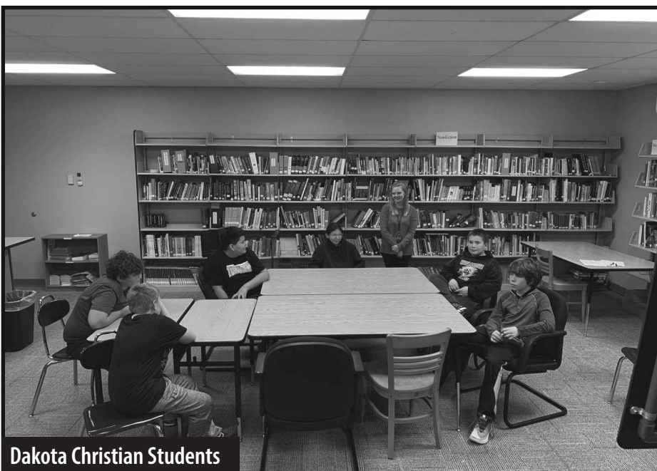
Dakota Christian Students