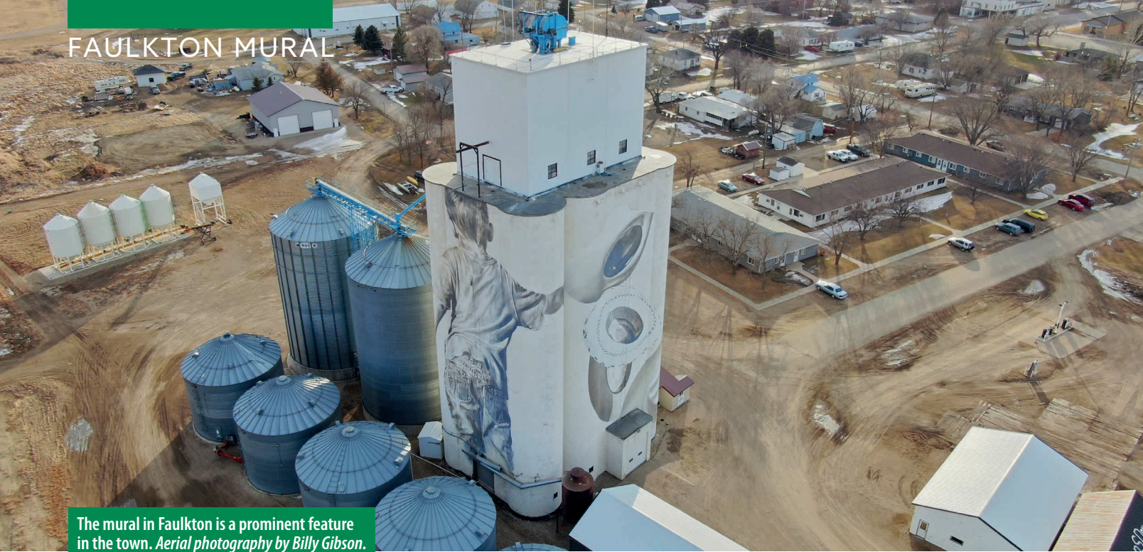
The mural in Faulkton is a prominent feature in the town.