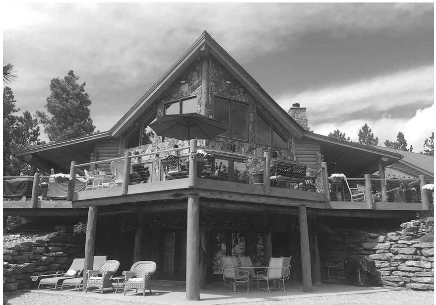
Log cabin in Vanocker Canyon