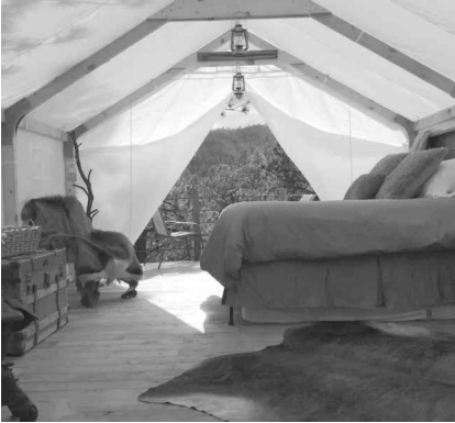
The Still House near Rapid City