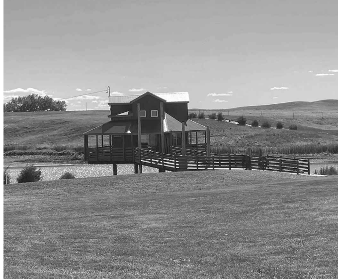
Cabin over water on the prairie near Philip