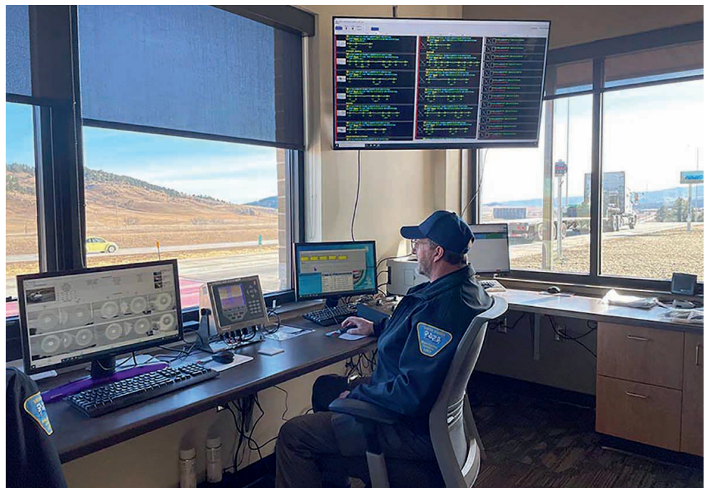
A SDHP officer has the latest technology at his or her fingertips to ensure trucks on South Dakota roads are operating safely.

"It's kind of nice to be able to do that and make the day what you want of it."