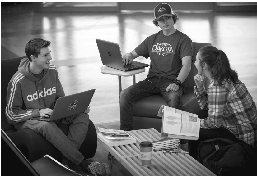
Students enrolled in Western Dakota Technical College's Dual Credit Program.

For more information on enrolling in the dual credit program, students and parents should reach out to their high school counselor's office or check out the options at https://ourdakotadreams.com/high-school/dual-credit/ .